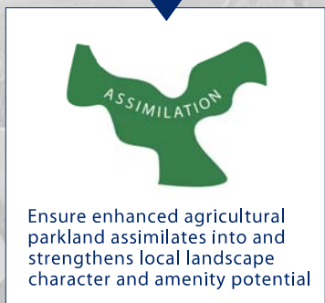
Ensure enhanced agricultural parkland assimilates into and strengthens local landscape character and amenity potential