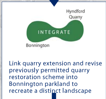
Link quarry extension and revise previously permitted quarry restoration scheme into Bonnington parkland to recreate a distinct landscape