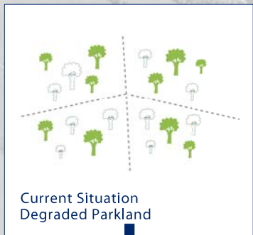
Current Situation Degraded Parkland

Opportunity to recreate and enhance the landscape of Bonnington Park through mineral extraction and restoration.