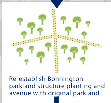
Re-establish Bonnington parkland structure planting and avenue with original parkland